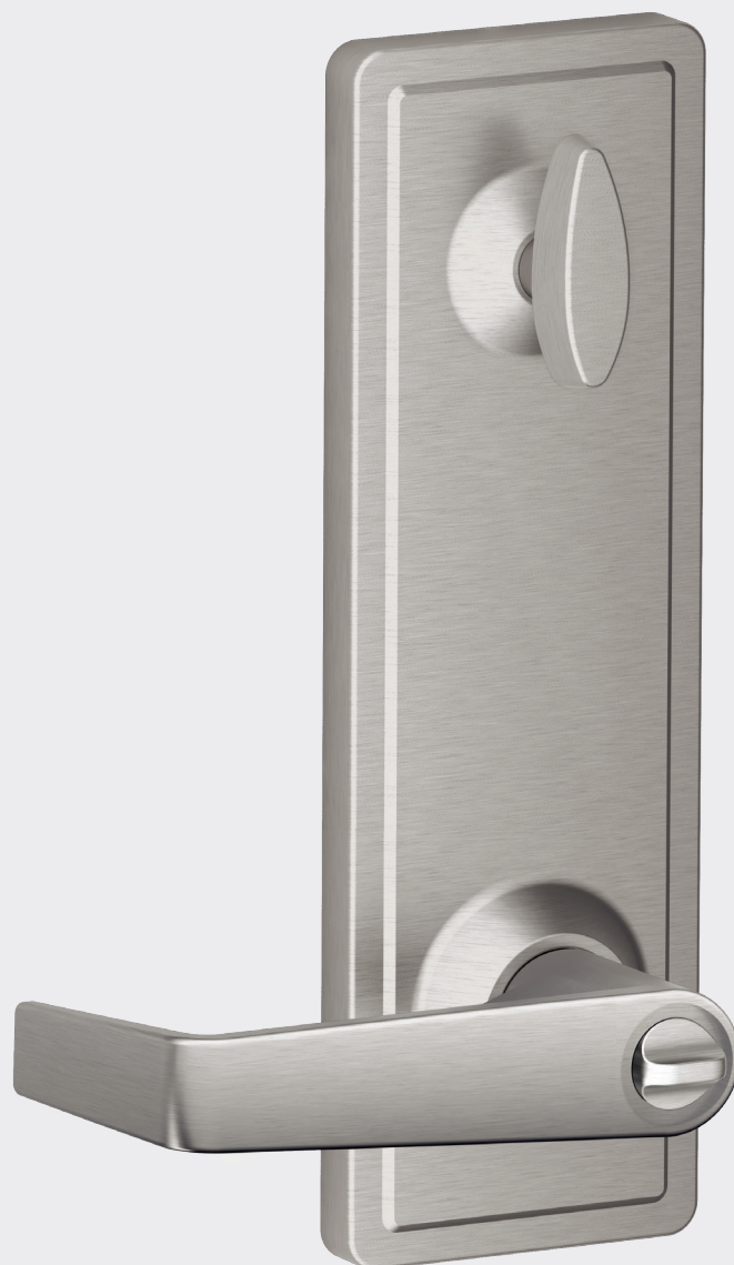
Satin Stainless Steel Interconnect Lock